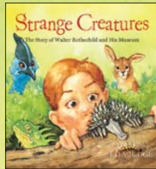
Strange Creatures Hardcover 978-1-4231-1389-8 $17.99