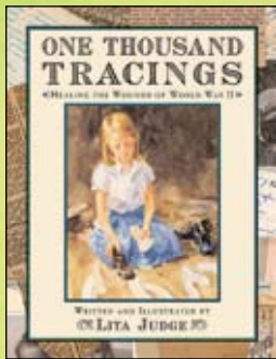
One Thousand Tracings Hardcover 978-1-4231-0008-9 $15.99